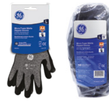
Hanging Card 12-Pack